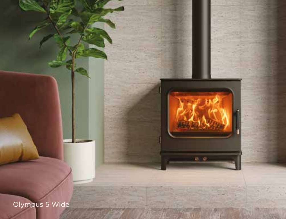
Olympus 5 Wide