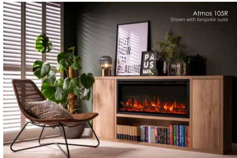
Atmos 105R Shown with bespoke suite