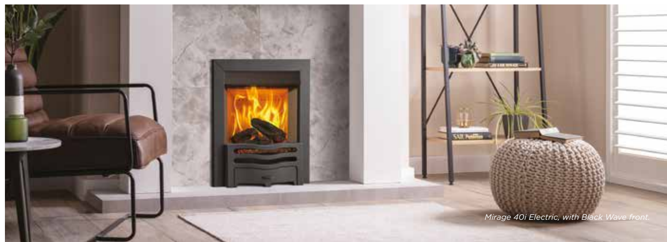
Mirage 40i Electric, with Black Wave front.

♦ Terms and conditions apply. See online for details