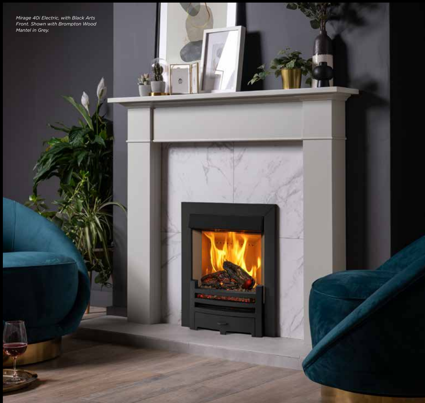
Mirage 40i Electric, with Black Arts Front. Shown with Brompton Wood Mantel in Grey.

Paper sourced from sustainable forests and printed using vegetable-based inks.