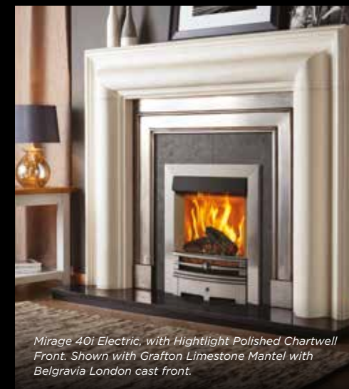
Mirage 40i Electric, with Hightlight Polished Chartwell Front. Shown with Grafton Limestone Mantel with Belgravia London cast front.