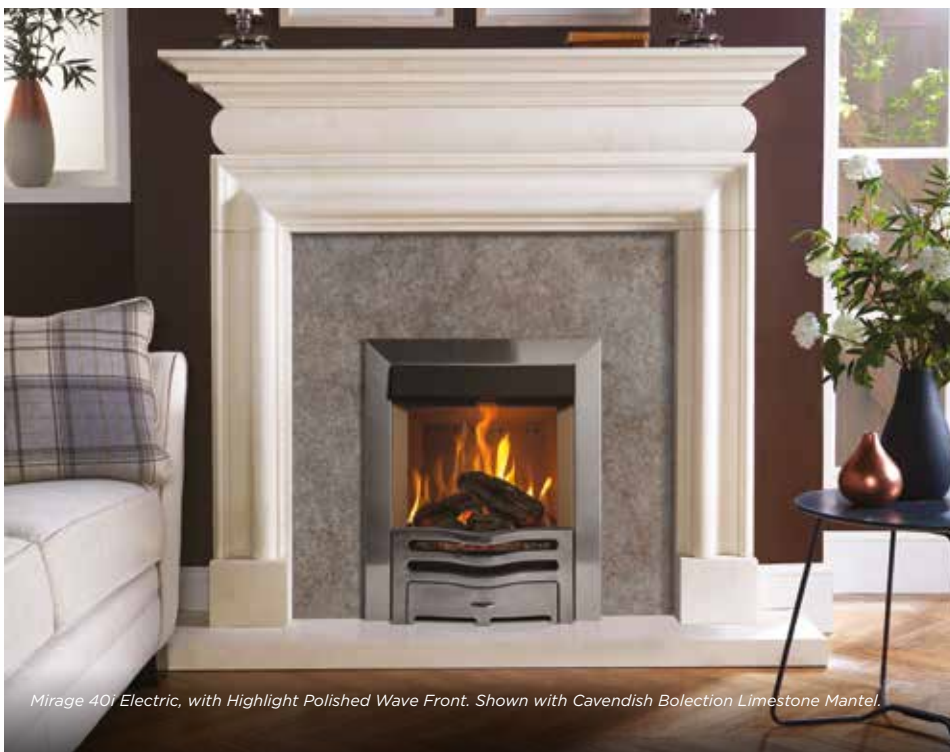
Mirage 40i Electric, with Highlight Polished Wave Front. Shown with Cavendish Bolection Limestone Mantel.

The ultimate sustainable heating solution, Mirage 40i Electric Fires deliver zero direct emissions, providing clean, efficient, and environmentally responsible warmth. When powered by renewable energy such as solar or wind, they offer an even greener way to enjoy comfort and ambience.